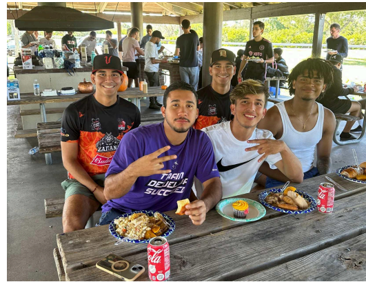
Thanksgiving Celebration 2023