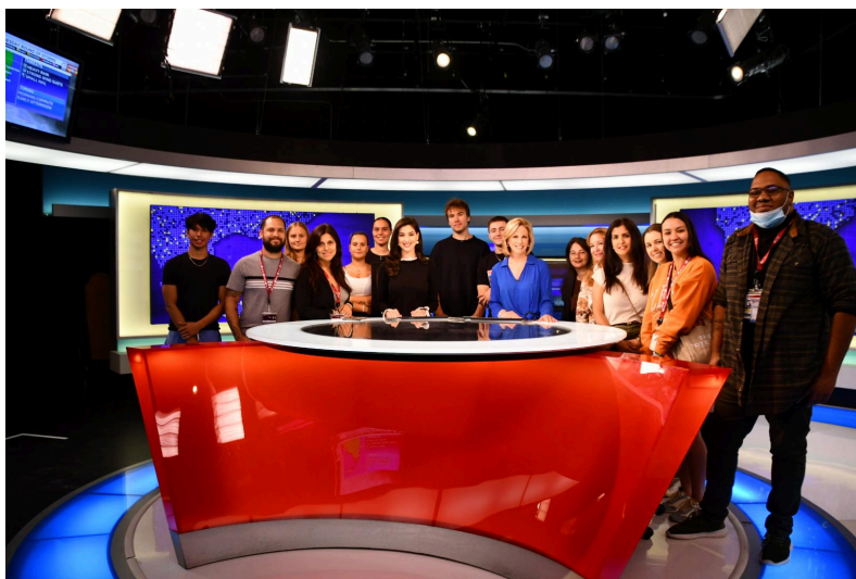
Field Trip to WPLG Channel 10 in the Spring of 2024

The program introduces students to the dynamic and multifaceted media industry with courses on photography, radio, film, and web-based media. Students develop media literacy and basic production skills. The program offers courses that combine theoretical approaches with practical application of knowledge into curricula.