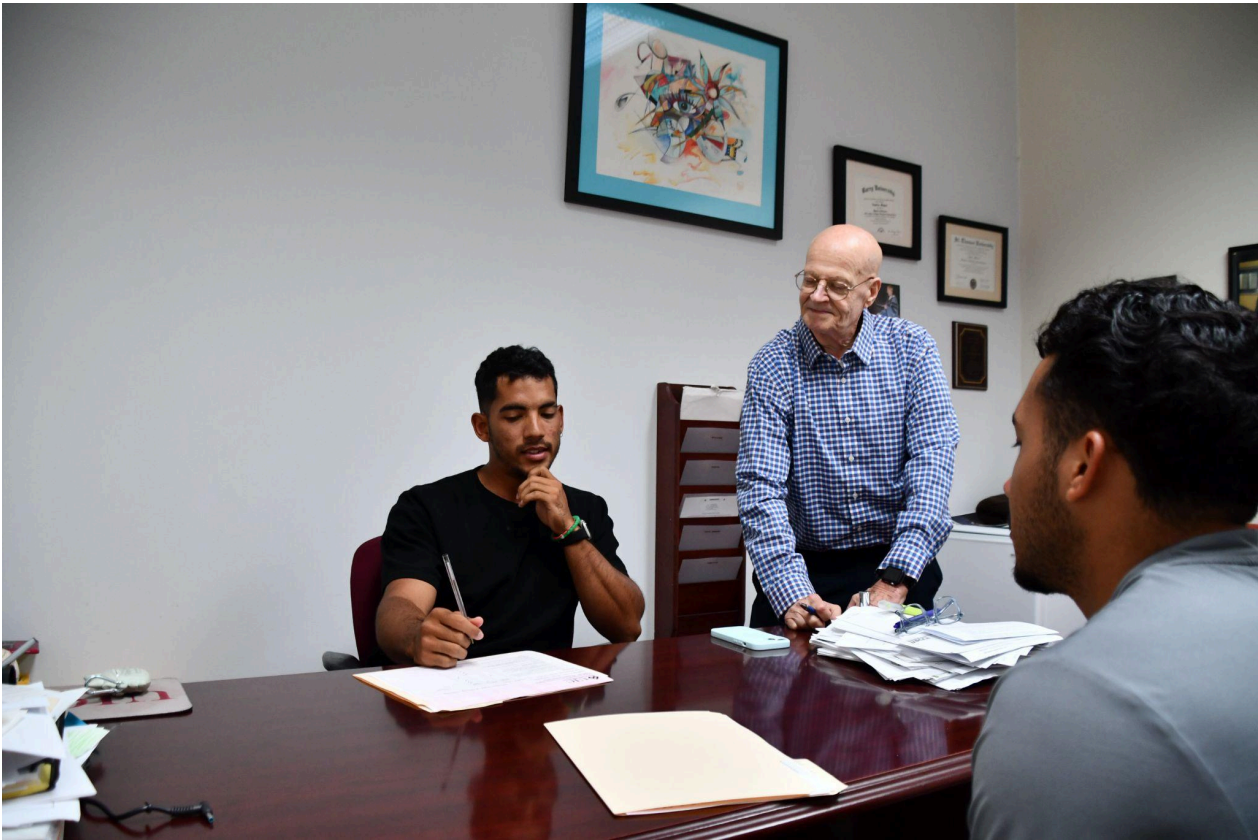
Mock Interviews 2024

All Credit Courses from within this division or any other division can be used as recommended Electives.