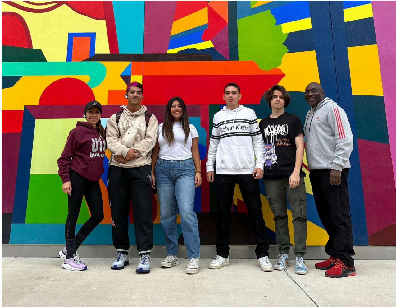
Field Trip to Miami Art Basel "On Tour" Winter 2023

All Credit Courses from within this division or any other division can be used as recommended electives