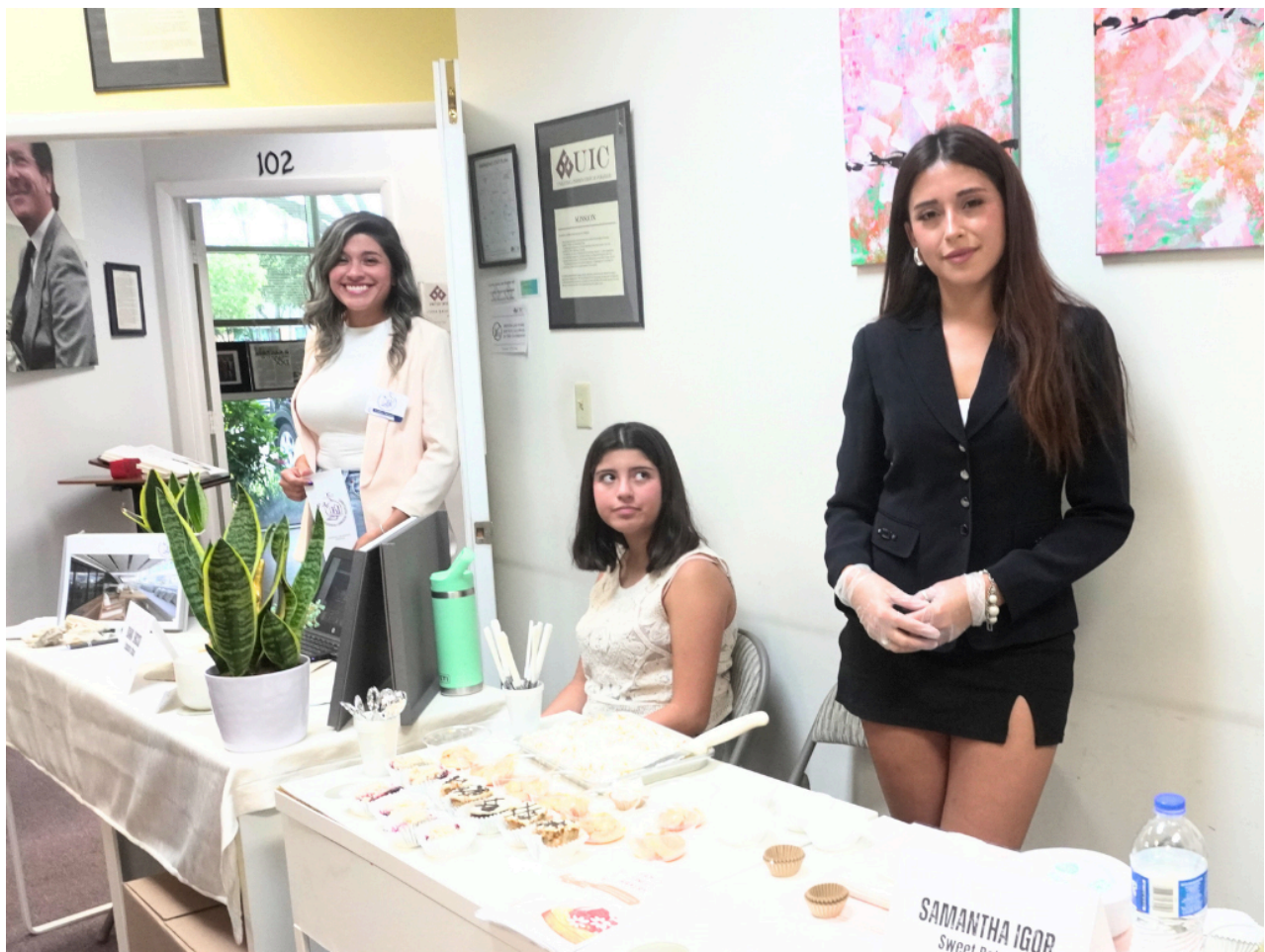
Business Expo 2024

All Credit Courses from within this division or any other division can be used as recommended Electives.