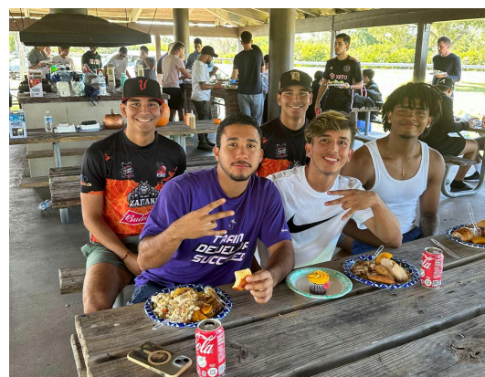
Thanksgiving Celebration 2023