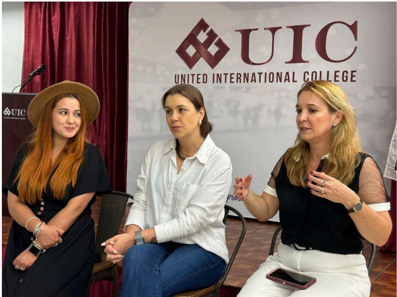
Summer Student Work Art Showcase 2024

Selected courses that participate in this Student Art Showcase are Photography, Drawing, Documentaries, Speaking on Radio, Animation and Entrepreneurial Creativity And Innovation. Students, faculty and local entrepreneurs attend this event to learn about the ongoing learning of UIC students. The Student Art Showcase is organized by the communications and advancement office