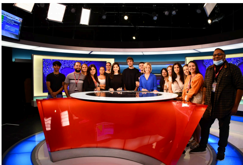
Field Trip to WPLG Channel 10 in the Spring of 2024

The program introduces students to the dynamic and multifaceted media industry with courses on photography, radio, film, and web-based media. Students develop media literacy and basic production skills. The program offers courses that combine theoretical approaches with practical application of knowledge into curricula.